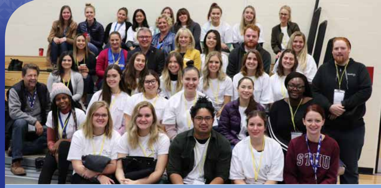
Members of the St. Mary's President's Volunteer Team volunteering at the Pass It On initiative at Father Lacombe High School on Friday, October 18, 2019.